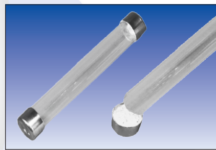
940HT Bonds a Sapphire Tube To a Metal End Cap for Use at 2650°F