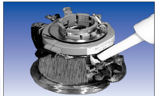
4460 Penetrates and Encapsulates a Tightly Wound Coil