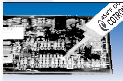
Duralco™ 125 Replaces Soldering on a Circuit Board