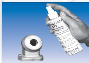
105RP Prepares Surfaces