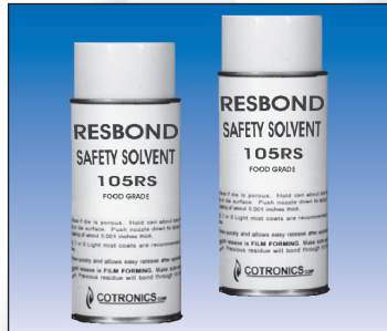
105RS Safety Solvent