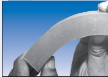
105RF Epoxy Flexibilizer