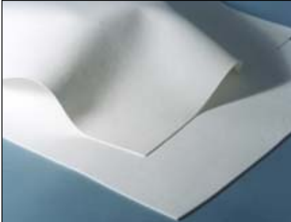
Flexible Zirconia Felt Types ZYF-50 and ZYF-100 are stocked in 18" x 24" sheets.